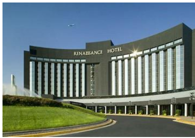
Renaissance Hotel St. Louis Airport 9804 Natural Bridge Road St. Louis, Mo. 63134 1-800-468-3571

This year’s conference will be held again at the Renaissance St. Louis Airport located adjacent to the St. Louis Lambert Airport. For those attendees traveling by air, a complimentary shuttle service is available for transportation to and from the hotel. Hotel reservations should be made directly with the hotel by WEDNESDAY, OCT. 26 in order to secure the conference rate of $114.